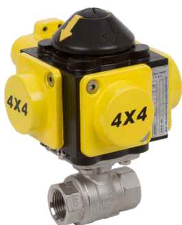
Pictured with 4x4 Actuator

Size Range: 1/4" - 2" Body Material: 316 Stainless Steel Seat Material: TFM® Ends: Threaded Max Pressure: 1000 CWP Max Temp: 450° F