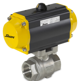
Pictured with SPNII Actuator

Size Range: 1/4" - 2" Body Materials: 316 Stainless Steel, Carbon Steel Seat Material: TFM® Ends: Threaded Max Pressure: 1500 CWP Max Temp: 450° F