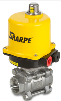
Pictured with SEA Actuator

Size Range: 1/4" - 4" Material: 316 Stainless Steel Seat Materials: TFM®, RTFE Ends: Threaded, Socket Weld, Butt Weld Max Pressure: 1000 CWP 1/4" - 2" 600 CWP 2 1/2" - 4" Max Temp: 450° F